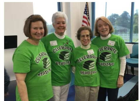
Friends of the Oconee County Library came to the Annual Meeting ready to “Celebrate Reading”!