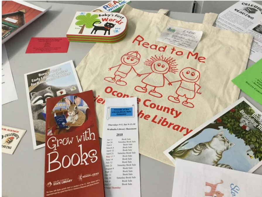
Friends groups share their promotional materials at the Annual Meeting.